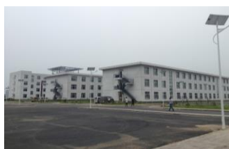
Pic. 3 Main building and living buildings, from left to right