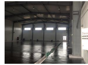
Pic. 10 Inside the hangar

The Terminal Building (circle 4) is on the east of the living building. The main hall will be used as a coffee bar open to all the competitors and officials, also running at night. The toilets are available in that building.