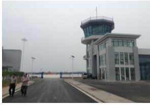
Pic 5. Entrance to the runway and hangar.