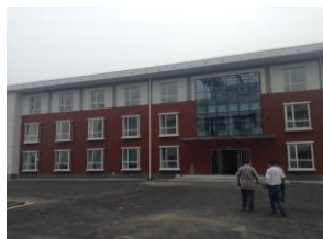
Pic.2 Main building:

The judging rooms and judge training rooms will be set at the main building (circle 1). The building is also used for daily office work by the sports centre. So the desks, chairs, televisions, DVDs, printers etc. are sufficient for competition use.