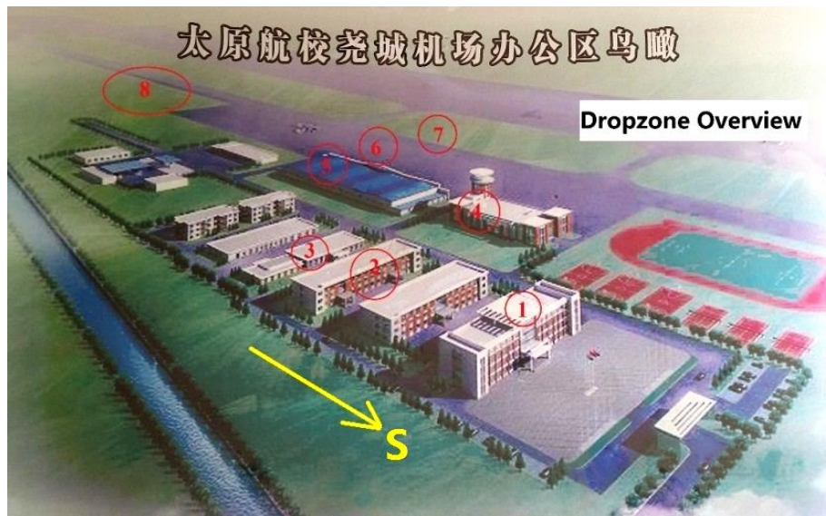
Pic. 1 Overview

They have full control for the airport facility and buildings within the Drop Zone.