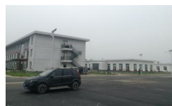
c. 4 Dining room (on the right)

- Next to the main building, there are 2 living building (circle 2) contain 140 standard rooms, there are 2 beds in each room, each room has the bathroom with 24 hours hot water. All the delegations, judges and officials will be arranged to these rooms. Each building has 3 floors and about 24 rooms in each floor.