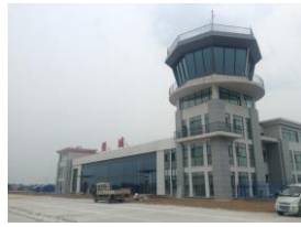
Pic 6. Front view of the terminal building