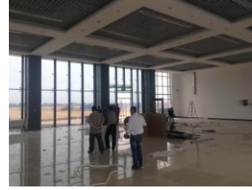
Pic 7. Inside of the terminal building